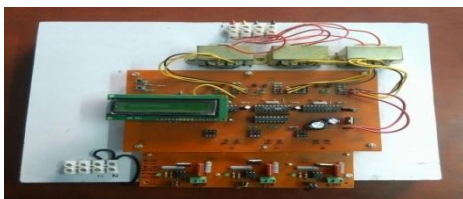
Fig. Circuitry for phase angle control method

In phase angle control, a gate pulse is sent to triac. This is sent at a time between one zero crossing and the next. Without the gate pulse sent to the triac, right after zero crossing, the triac is OFF and no current flows through it. After a certain time the gating signal is given to the triac and it turns ON. The triac then stays ON until the current through it becomes zero. This is at the next zero crossing.