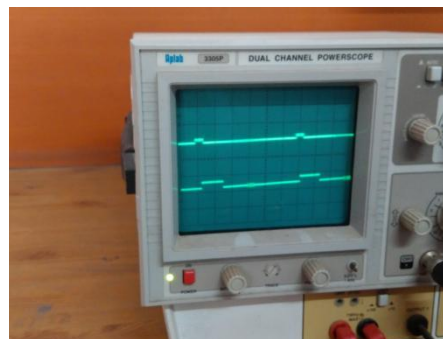
Fig. Output waveforms of zero crossing detector

The waveforms of zero crossing detector are as follows: